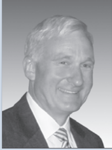
Rhode Island Supreme Court Chief Justice Paul A. Suttell

Awards Luncheon – Convention Center, 1st floor THIS IS A TICKETED EVENT